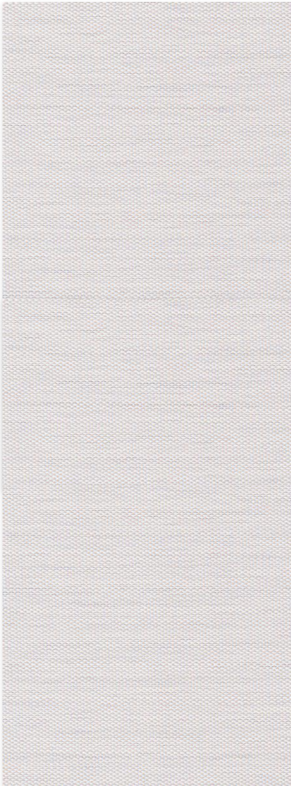
002020 | White/Linen